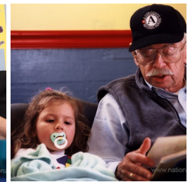
Veterans and Military Families

Organizations that intend to operate in only one state must apply through the Kansas Volunteer Commission. Organizations that propose to operate AmeriCorps programs in more than one state or territory should apply directly to the Corporation for National and Community Service (CNCS). Federally-recognized Indian Tribes may apply to either the KVC or CNCS.